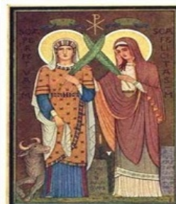
St. Perpetua and Felicity (St. Mary)